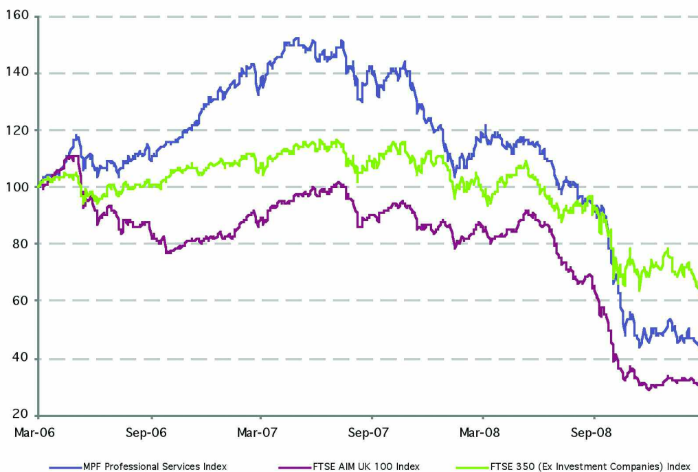
MPF Index (blue) v FTSE 350 (green)

Based on historic data for the three years to March 2009, our new index outperformed the FTSE AIM UK 100 but was more volatile than the FTSE 350 Support Services index and the FTSE 350 (excluding investment companies) indices.